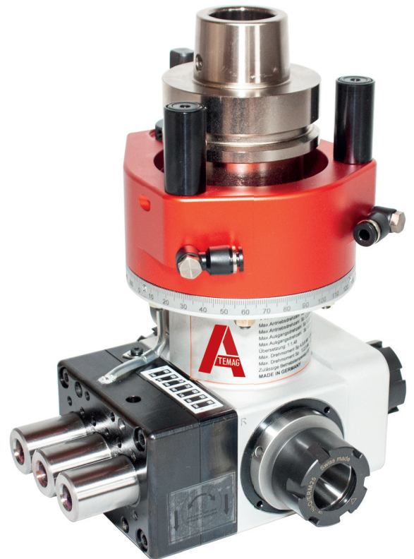
Spindle arrangement and number of spindles according to customer specifications